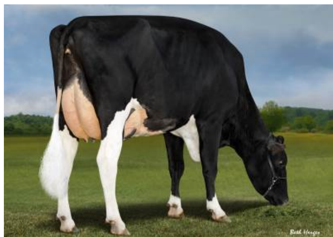
Dam: San-Dan Charl 646-ET VG-87