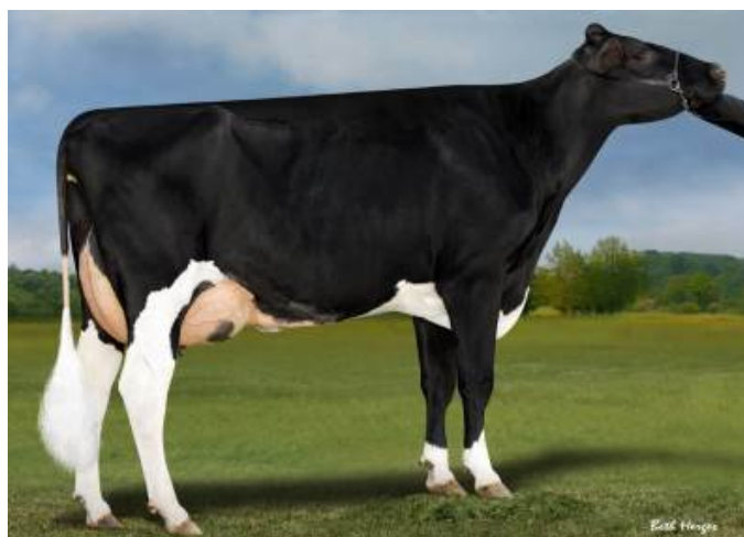
Dam: San-Dan Charl 646-ET VG-87

MGGS: Mr Mccut Dante 1407-ET MGGD: Farnear Lomita Mon 54486-ET